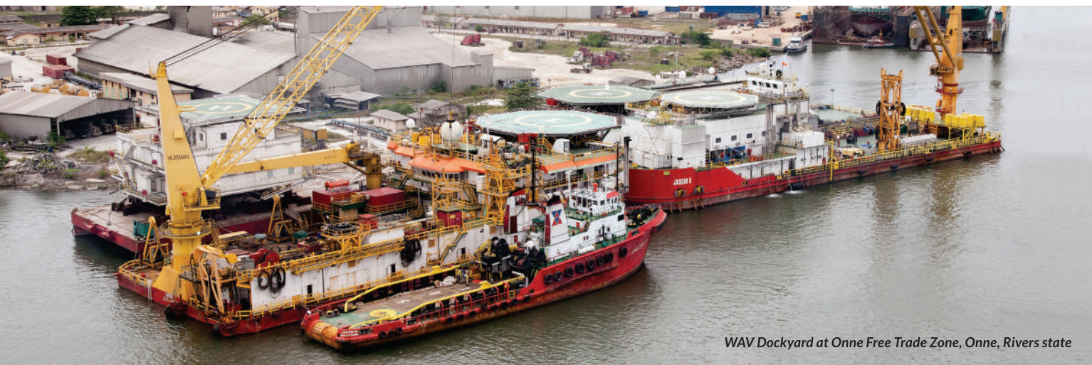
WAV Dockyard at Onne Free Trade Zone, Onne, Rivers state