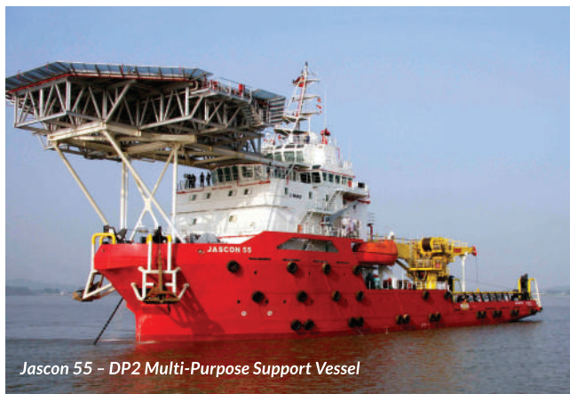
Jascon 55 - DP2 Multi-Purpose Support Vessel