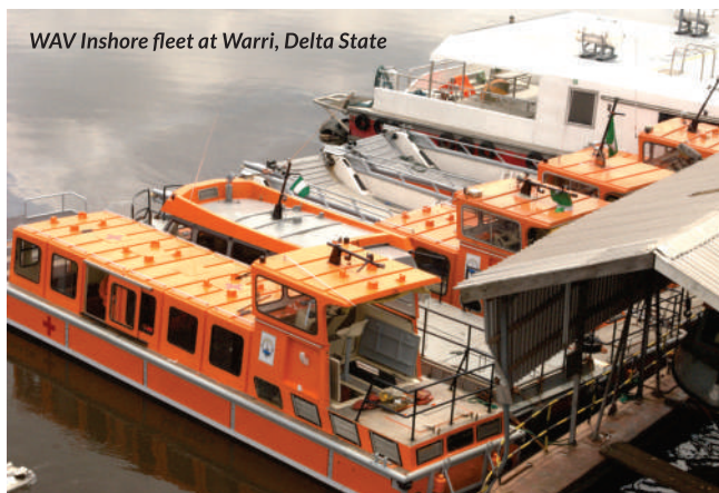
WAV Inshore fleet at Warri, Delta State

WAV has always maintained an excellent record of working favourably with local communities. Therefore, the establishment of the Nigerian Content Development & Monitoring Board (NCDMB) in 2010 was a big boost to the company, as this simply complemented their estwhile efforts. Their achievements in the development of in-country capabilities in line with operations has earned the company 85,000 man-hours with OGTAN registered Trainers. According to the Managing Director, "we believe in the importance of capacity building. The economy of Nigeria currently depends on the Oil and Gas sector, and this makes it very necessary for us all to strive towards the improvement of in-country capabilities in this sector. The need for economic independence for Nigeria cannot be over-emphasized and WAV is passionate about working closely with the Nigerian Content Development and Monitoring Board (NCDMB), to achieve a truly Nigerian managed sector. The road to this achievement is still far, but efforts to get there are surely underway."